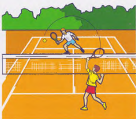
They are playing tennis ( now ).